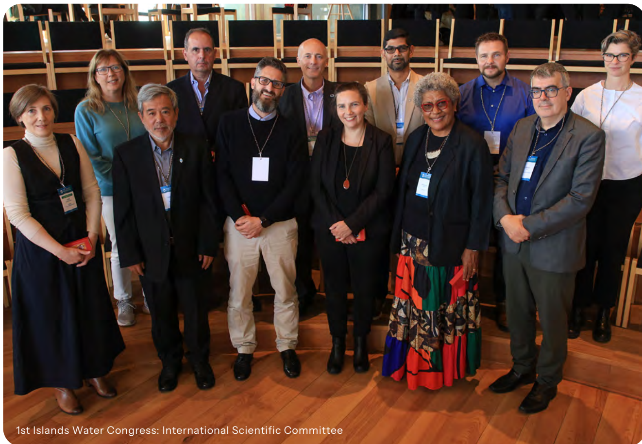
1st Islands Water Congress: International Scientific Committee

The next Islands Water Congress will be held in Montego Bay, Jamaica, 9-11 December 2026.