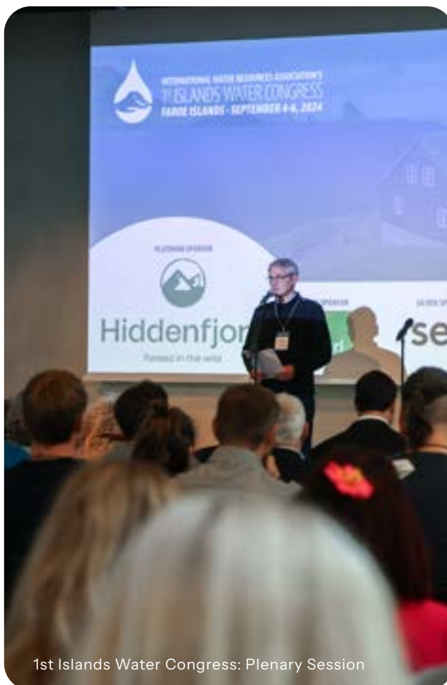
1st Islands Water Congress: Plenary Session

at least 10 months prior to the Islands Water Congress