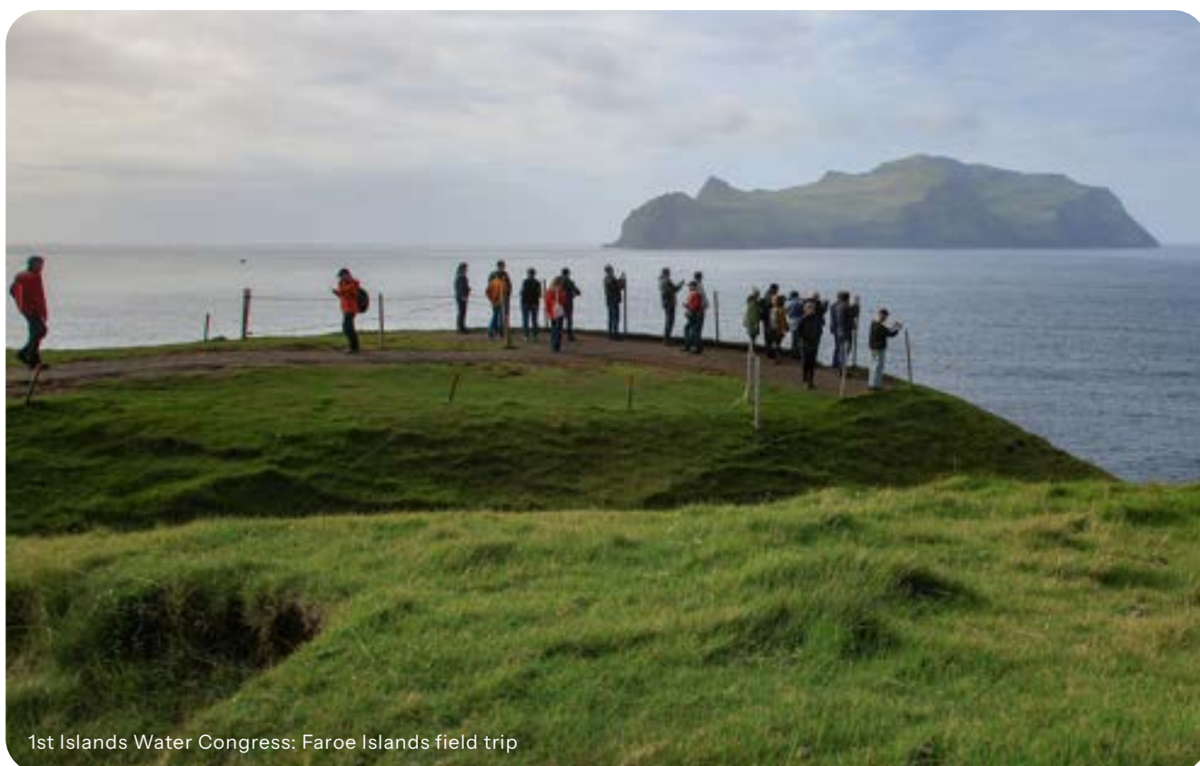
1st Islands Water Congress: Faroe Islands field trip