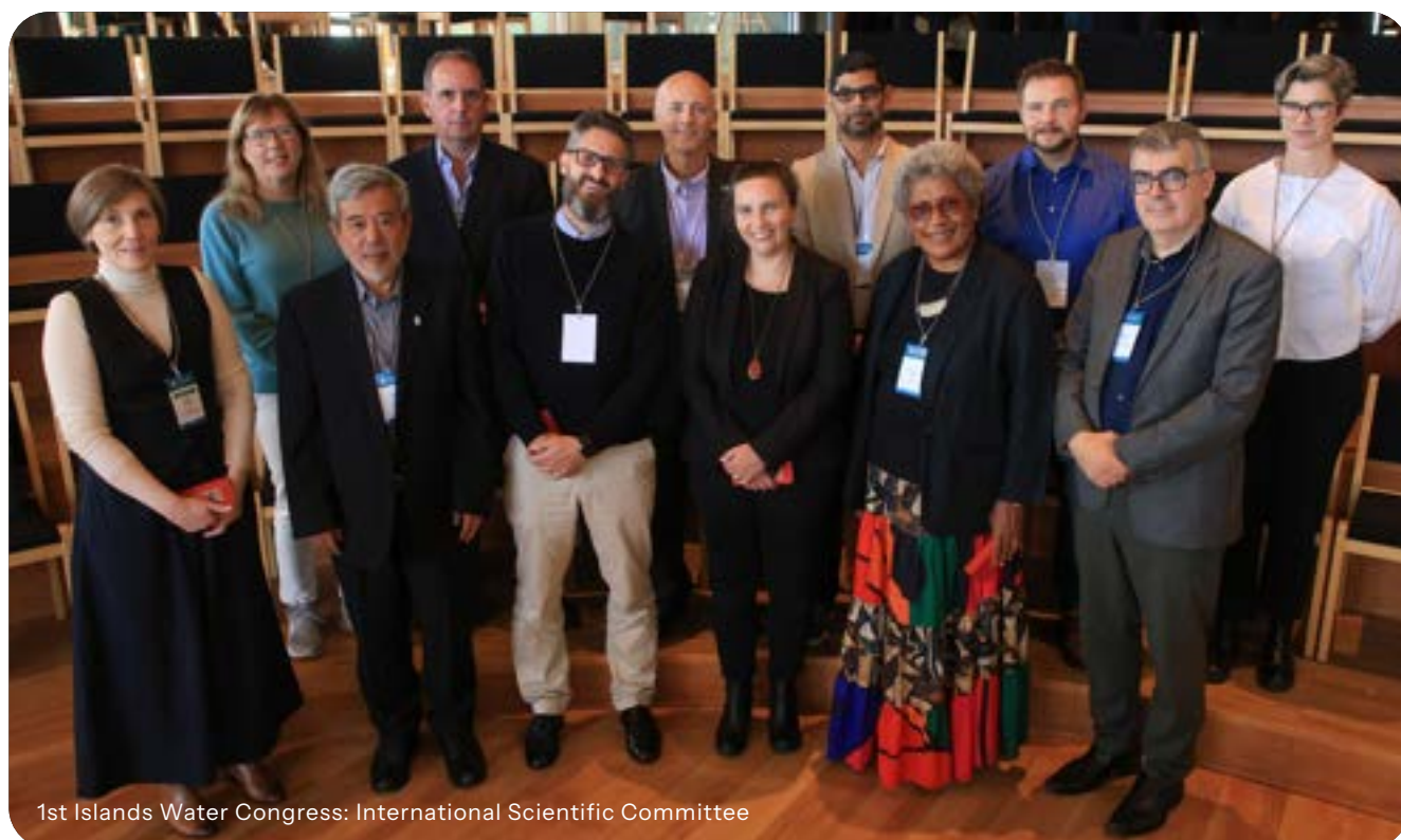
1st Islands Water Congress: International Scientific Committee

Creates a lasting legacy by strengthening relationships and building local capacity for island communities, while generating outcomes that extend far beyond the event itself.