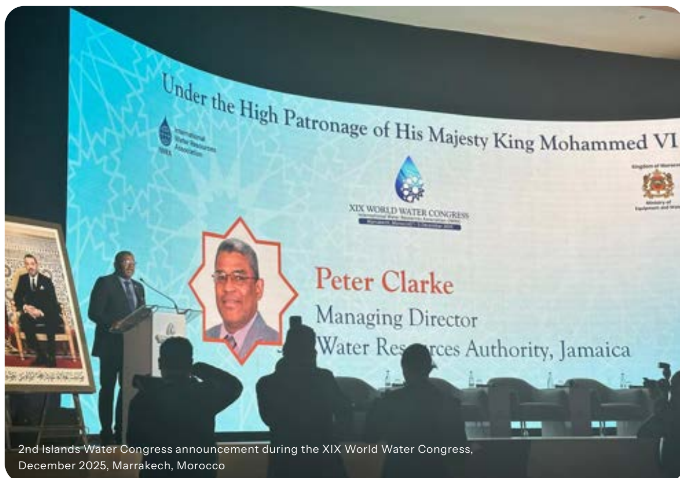
2nd Islands Water Congress announcement during the XIX World Water Congress, December 2025, Marrakech, Morocco

If possible, representatives from the host will attend an upcoming IWRA World Water Congress or Islands Water Congress to formally announce their successful candidature and start promotion of their Islands Water Congress.