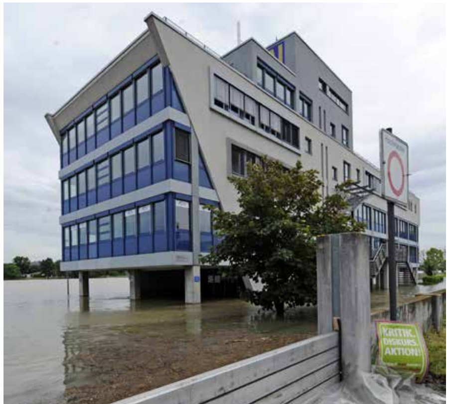
Resilient City LUDWIGSHAFEN, 2013, DE, Martin H. Hartmann

Flood storage cuts off the peak of a flood wave by diverting waters at the right moment , commonly onto fertile agricultural land in floodplains. Therefore, the greatest challenge is getting impacted landowners on board by linking private loss with social benefits of flood storage.