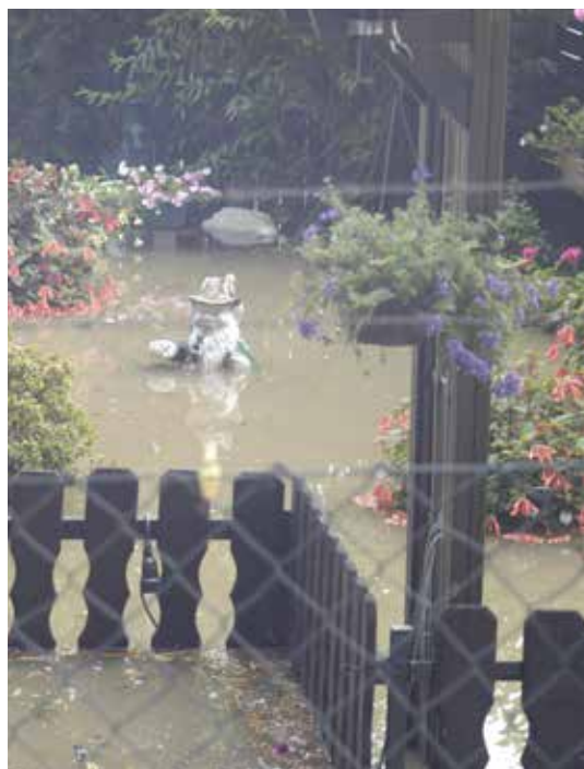
Flooding along the river Ruhr SCHWERTE, 2008, DE

This policy brief is a collaborative effort of the members of the LAND4FLOODS (Natural Flood Retention on Private Land) COST action that emerged from the FLOODLAND network, an independent research-driven network of academic and practitioners interested in how to make land available for flood risk management ( www.land4flood.eu ).