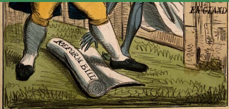
JOHN BULL CATCHING THE CHOLERA

SANITATION IS ENTWINED WITH A COLONIAL PAST AND IS HIGHLY GENDERED.