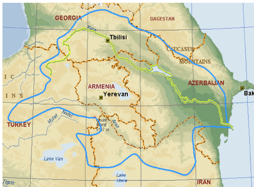
Figure 1: Map of the South Caucasus with delineated Kura-Araks basin

(2) c/o Division of Water Sciences, UNESCO, 1 rue Miollis, 75732 Paris Cedex 15, France phone : +33 1 45 68 40 01, e-mail: a.movsisyan@unesco.org