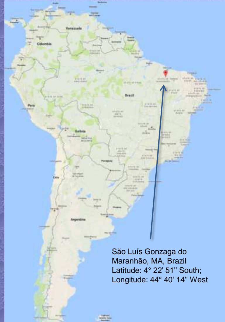
São Luís Gonzaga do Maranhão, MA, Brazil Latitude: 4° 22' 51" South; Longitude: 44° 40' 14" West