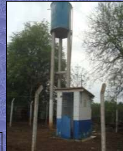
Simplified Water Supply System (Tube Well)