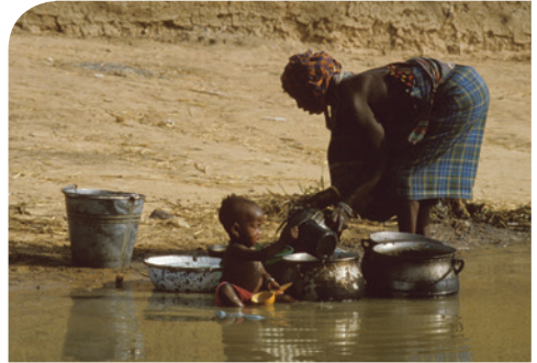
Everyday life, Internal Delta, Niger, O. Barrière © IRD

IWRA seeks to continually improve water resource decision-making through advancing the collective understanding of physical, ecological, chemical, institutional, social and economic aspects.