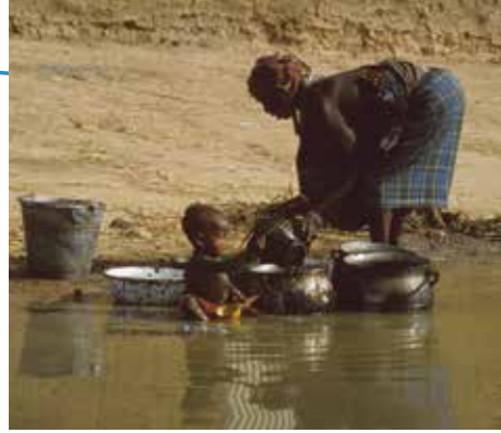
Landscape of the desert, Libya.

IWRA has developed geographical committees to further implement its mission and focus its activities. These committees allow for extensive regional networking among IWRA members.