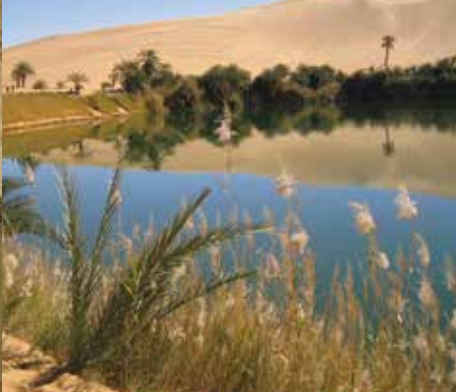
Everyday life, Internal Delta, Niger

If you are interested in taking part in IWRA's publications or would like more information, please contact the IWRA Editorial Office: iwrapubs@gmail.com