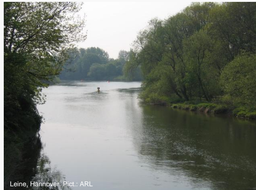
Leine, Hannover.