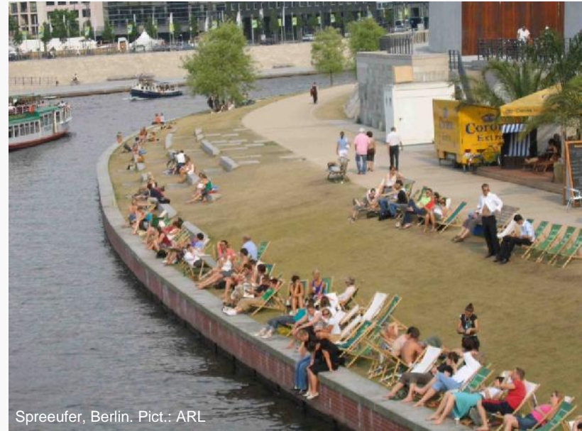
Spreufer, Berlin.